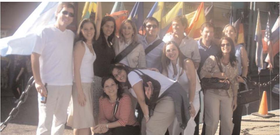
2006 Latin American Alumni meeting in Buenos Aires, Argentina

For information on Alumni activities, please visit the CAIL website and go the Academy Alumni link.