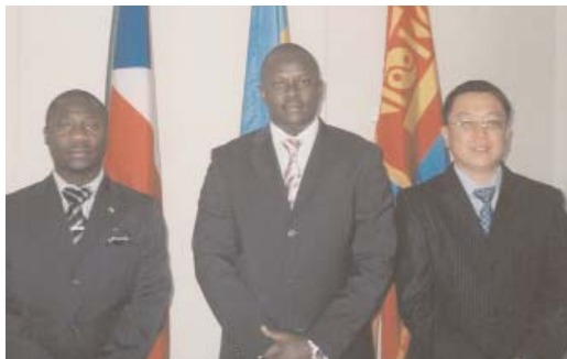
The 2006 Academy included our first participants ever from (left to right) Equatorial Guinea, Rwanda and Mongolia.