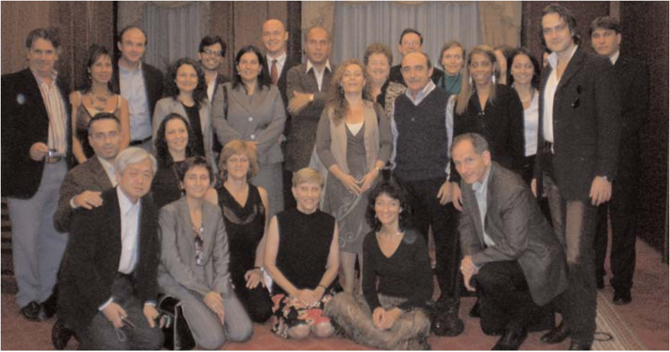
European Alumni meeting in Sofia in October 2006